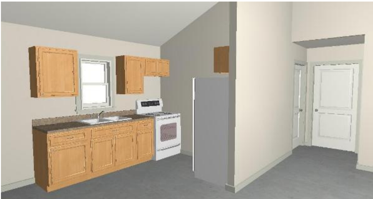
Kitchen & Hall